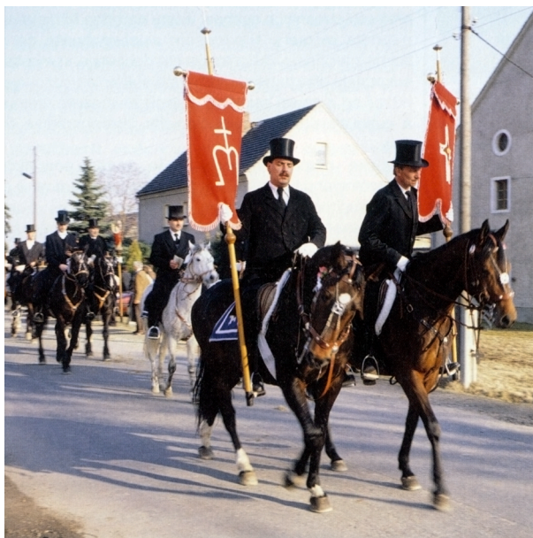
Easter Riding in the Catholic Sorbian Communities

Developments since reunification, however, pose threats to the factors that have fostered language vitality in the Catholic Sorbian-speaking area. First, reunification, coupled with contemporary geographical mobility, means that the marriage pool as defined by religion is much greater - in Germany as a whole, Catholics and Protestants are about equal in number; Catholic Sorbs for whom marrying a Catholic is more important than marrying a Sorbian-speaker are no longer effectively limited to a choice among Sorbian-speakers. Second, and perhaps even more important, there are currently no Sorbian-speakers in Catholic clergy there are unlikely to be Sorbian-speaking clergy capable of communicating with their parishioners in Sorbian.