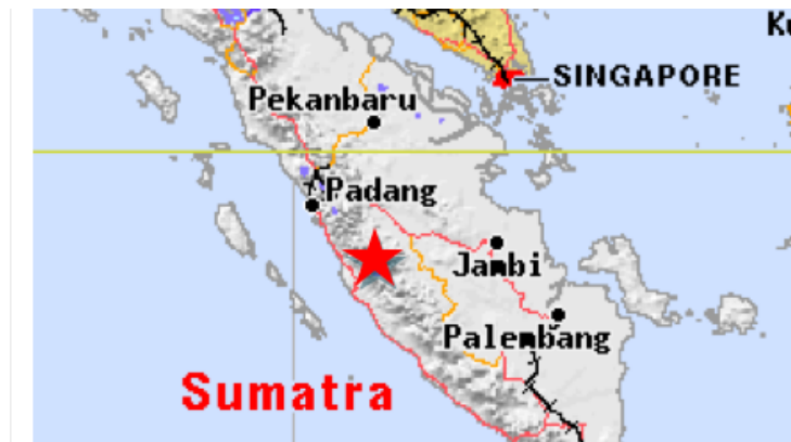
Map 1. Location of Tanjung Pauh Kerinci