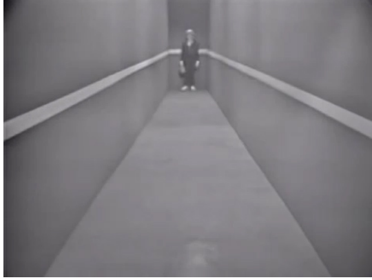
Advertisement by Westinghouse Electric Corporation, 1950