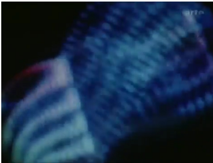
Nam June Paik, Beatles Electroniques , 1969